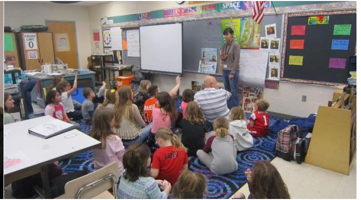
At left is the Conger Elementary School (Delaware, OH) Good News Club team in training. At right is the actual Club teaching children about Jesus. Pray for all our children as Clubs wrap up for this school year!

We praise the Lord for your faithfulness in prayer and support of this ministry. The Lord is using you to make a difference in lives. I often think of a statement made by dictator Adolf Hitler who said, "Give me your youth and I'll fire not a shot." I am afraid we in our country have given our youth over to the humanistic way of thinking. Only Jesus and His Word can bring salvation and the way to walk for His glory.